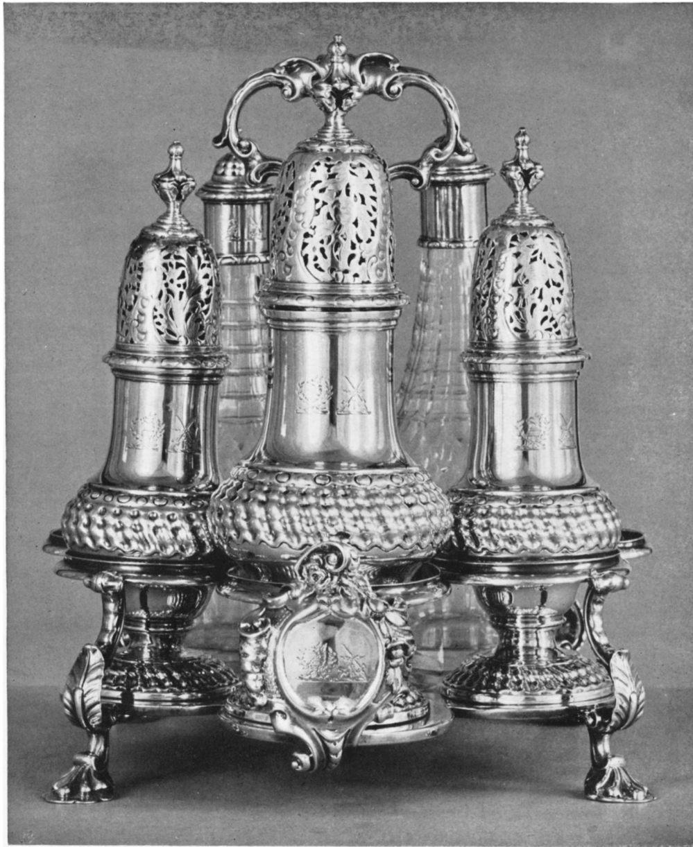
Cruet frame by Paul de Lamerie. 1750-51. (Lord Swaythling)